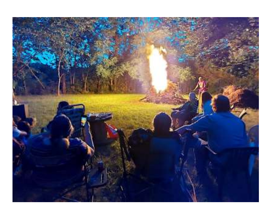
From the 2024 Annual BRUU Picnic