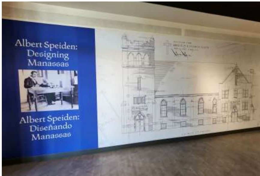
One of the original architectural designs for what is today the BRUU building, shown here as a mural at the exhibit “Albert Speiden: Designing Manassas.” The exhibit is currently on display at the Manassas Museum.